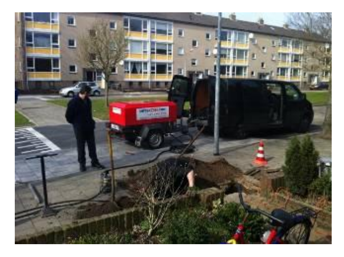
The launching pit is prepared.

The TERRA-HAMMER T 055 SK is very powerful but operates at a very low recoil. It is very easy to operate. This allows 5-10 house connections per day depending on the ground conditions and the piercing lengths.