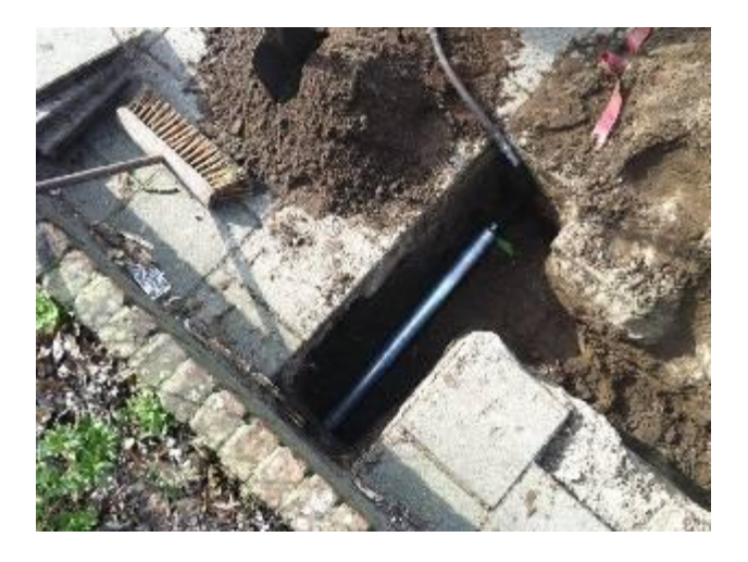
The TERRA-HAMMER T 055 SK penetrates into the ground.