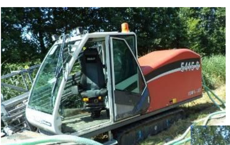
TERRA-JET 5415 S in the starting position of the 240 m (795 ft) long "lake bore".