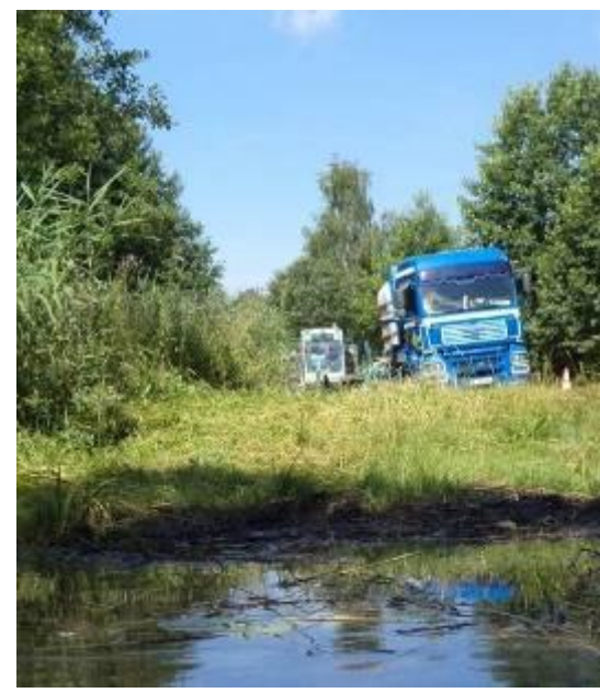
The TERRA-JET 5415 S in the starting position of the "lake bore".