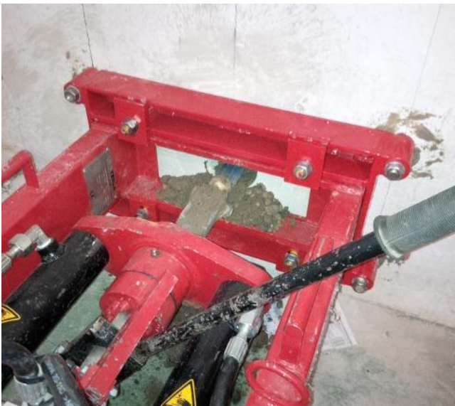
The new water line is pulled in.