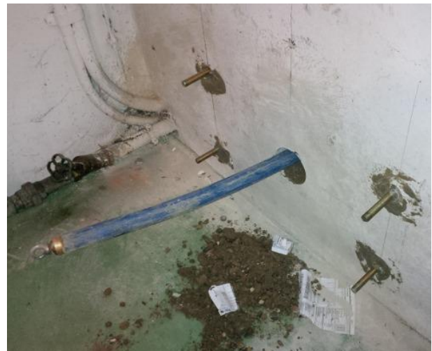
After pipe pulling the TERRA-JACK is disassembled. It can be carried easily by two persons. The water line is connected to the house installation.