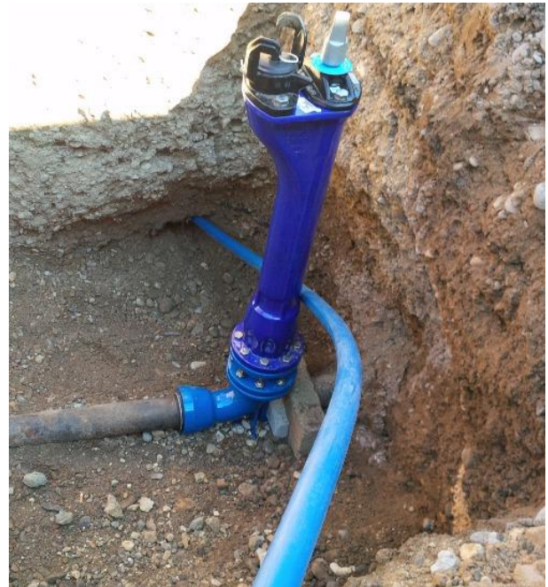
The pilot bore is expanded with the expander cone Ø 75 mm (3"). The new HDPE pipe OD 50 mm (2") is pulled in. The connection to the main water line is prepared.