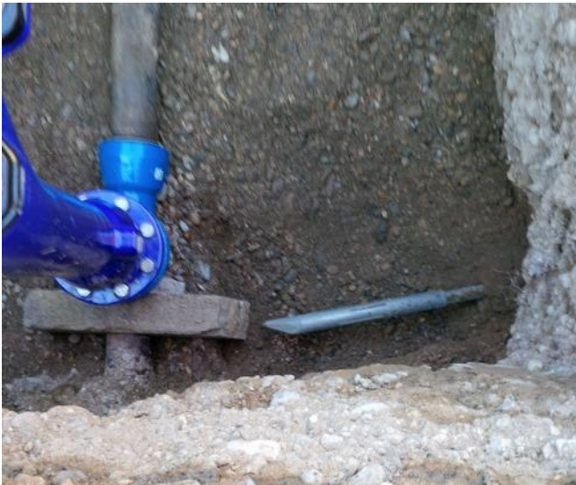
The drill head reaches the target pit after 18 m (60 ft).