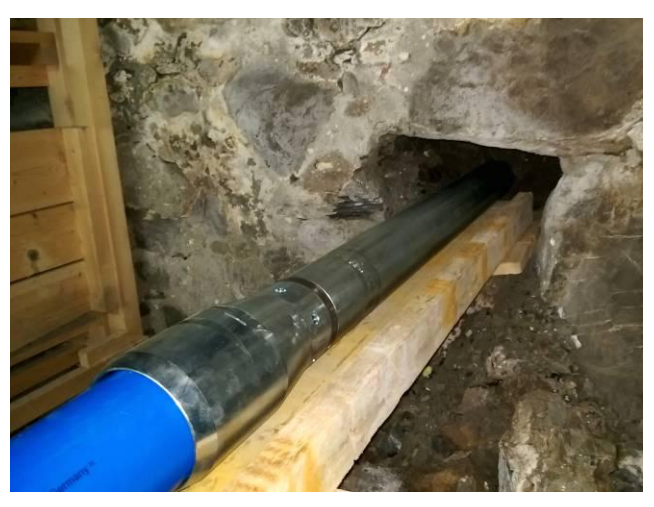
Pic 2: The oversized end sleeve expands the bore channel to 130 mm.

The company Gerber + Troxler Bau AG from the Bernese Oberland is rehabilitating the drinking water system. For the trenchless installations, especially house connections, the new piercing tool TERRA-HAMMER T 105 F was used. With the oversized end sleeve the 105 mm machine also allows pulling in of bigger pipes as in this case a 112 mm short pipe. The piercing tool was set up in the natural stone masonry within the basement. From there it drilled and installed simultaneously the protective pipes underneath the 7 m backyard. Into these protective pipes will then be installed the product pipe.