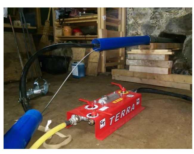
Pic 1: Installation of the piercing tool and the short pipes in the basement before starting the machine.