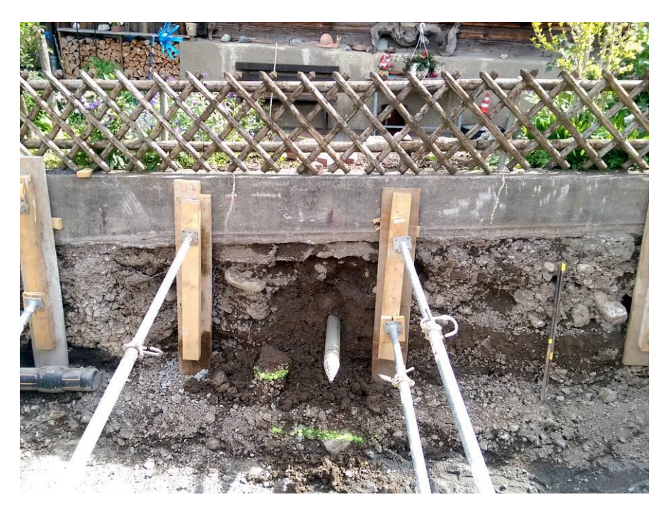
Pic 3: The T 105 F reaches the target with precision and at ease.

The company Gerber + Troxler Bau AG from the Bernese Oberland is rehabilitating the drinking water system. For the trenchless installations, especially house connections, the new piercing tool TERRA-HAMMER T 105 F was used. With the oversized end sleeve the 105 mm machine also allows pulling in of bigger pipes as in this case a 112 mm short pipe. The piercing tool was set up in the natural stone masonry within the basement. From there it drilled and installed simultaneously the protective pipes underneath the 7 m backyard. Into these protective pipes will then be installed the product pipe.