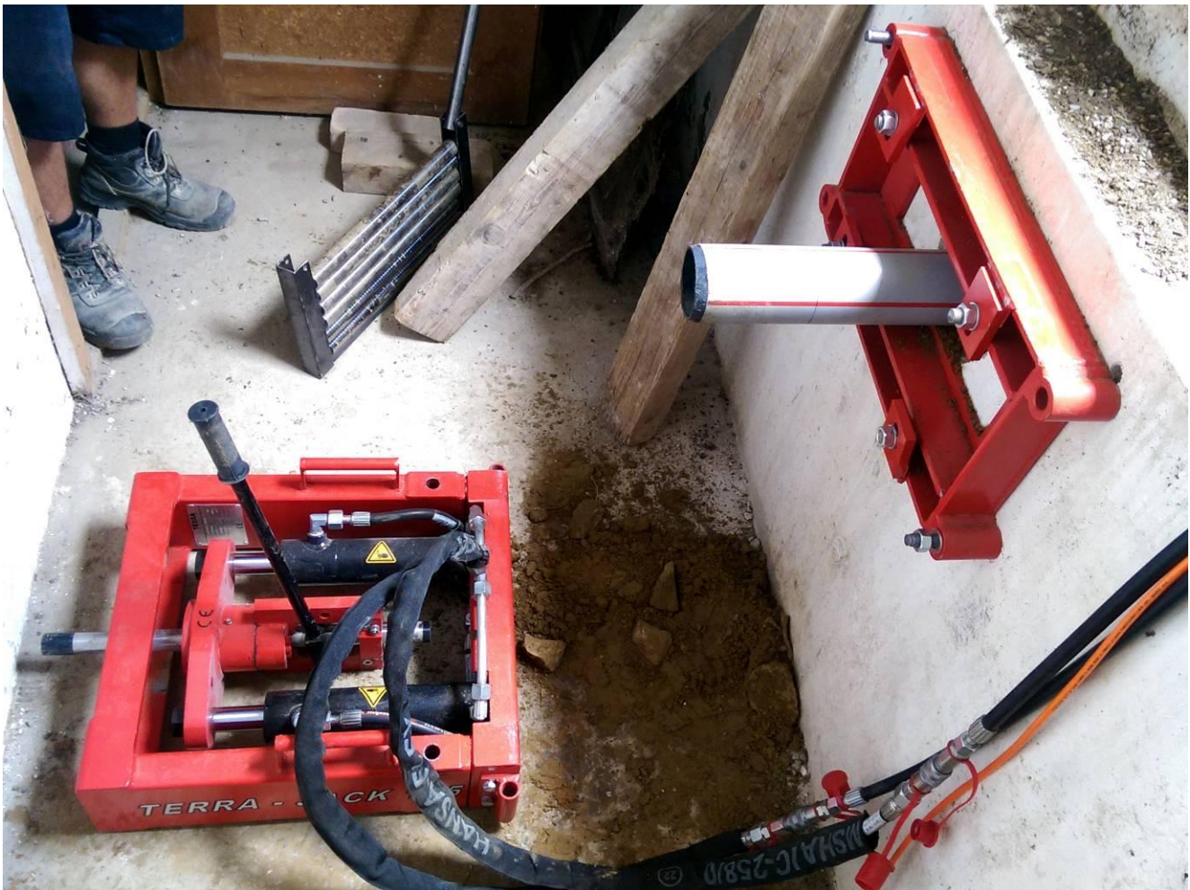
Pic 3: TERRA-JACK base unit after pipe pulling and removal from the wall flange.

Isch Bau from Aetigkofen (Solothurn) has used their new directional rod pusher TERRA-JACK 125 to install new electrical lines under the driveway and adjacent garden. The directional rod pusher TERRA-JACK 125 pushes with 12.5 metric tons (27'000 lbs) and combines the advantages of a piercing tool (dry process without bentonite) and HDD machines (steered bores).