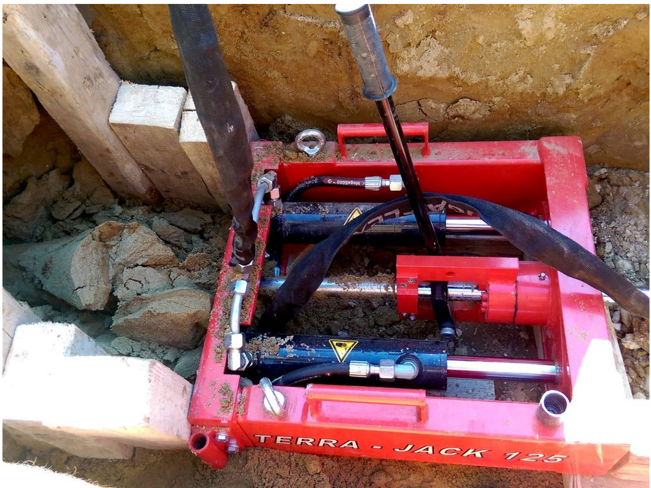
Pic 7: The TERRA-JACK 125 pulls the expander cone with forces of up to 12.5 tonnes (27'000 lbs) through the ground. Here the expander cone with pipe is just arriving at the end of pipe pulling-in.

A locating device such as DigiTrak Falcon F1 is used to track the bore and purposely reach steering radii up to 25 m (82 ft). For that purpose a transmitter is placed in a sonde-housing directly behind the drill head. This transmitter sends a signal through the underground to the receiver, where the bore can be tracked by the drilling team. Through rotation at the hand-operated lever on the TERRA-JACK the drill head is positioned in the desired orientation before pushing with the machine.