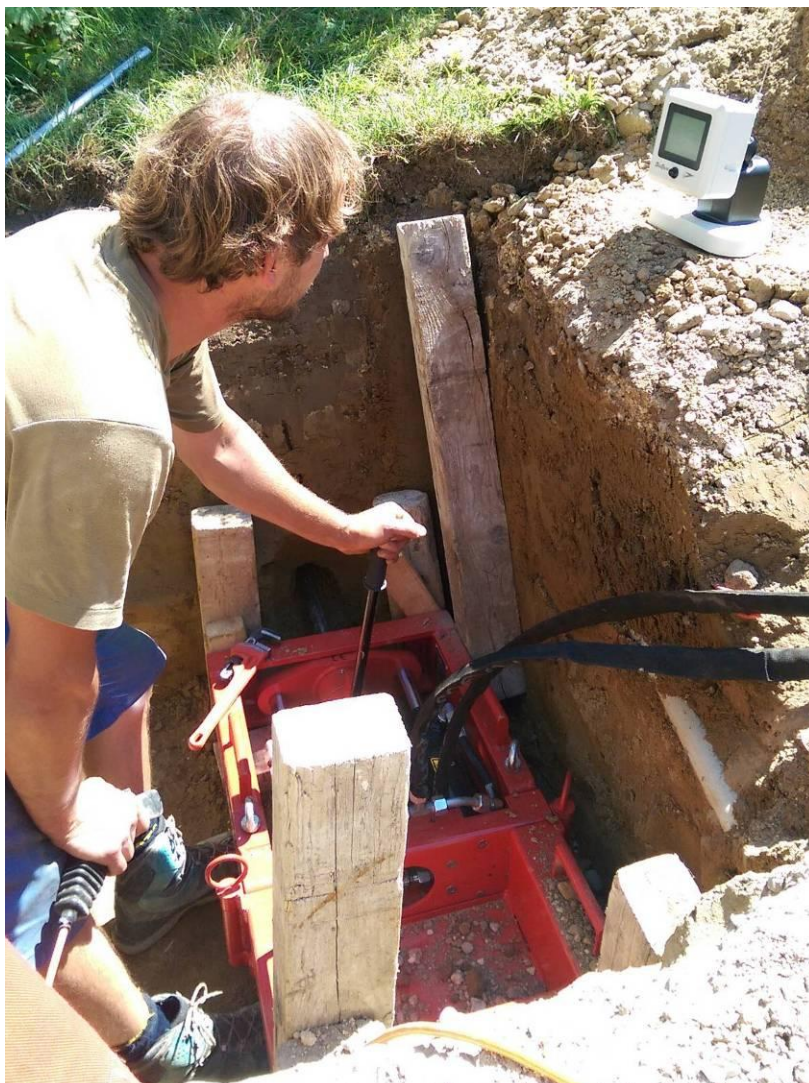
Pic 6: The operator is tracking the signal on the monitor which indicates the clock-position of the steering-press-head.