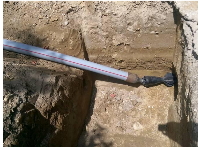
Pic 5: Pulling-in of a protective pipe outer diameter 92 mm (3.6"). Expanding of the bore channel and pipe pulling in one single step.