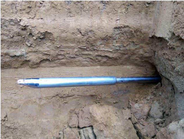
Pic 4: The pilot bore reaches the middle-pit dead on target in the corner, leaving enough room for the subsequent installation of the TERRA-JACK.