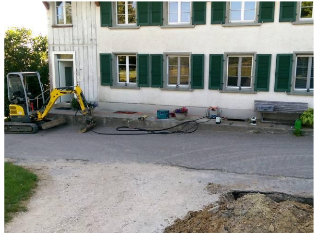
Pic 2: The TERRA-JACK is driven by a mini excavator. The hydraulic hoses are connected through the light well to the TERRA-JACK.