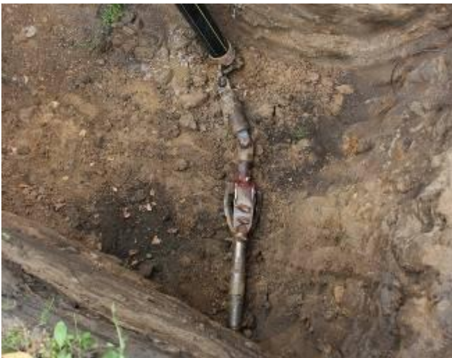
The backreamer and the new pipe are assembled. The backreamer is a self-construction of Burmontazh.