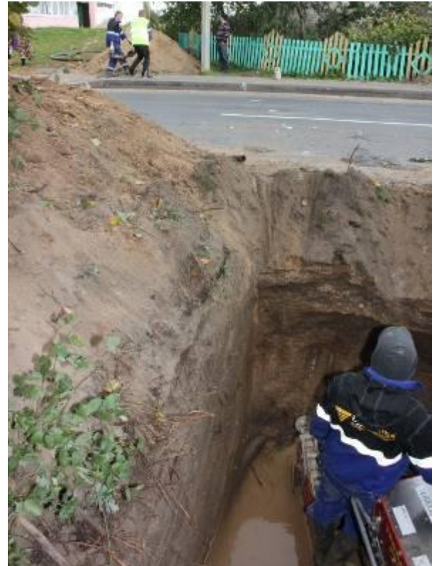
View at a typical road crossing.