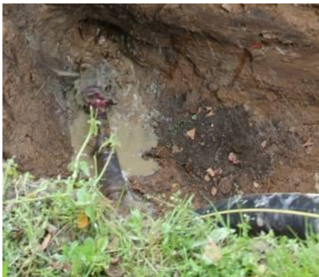
The pipe pulling begins.