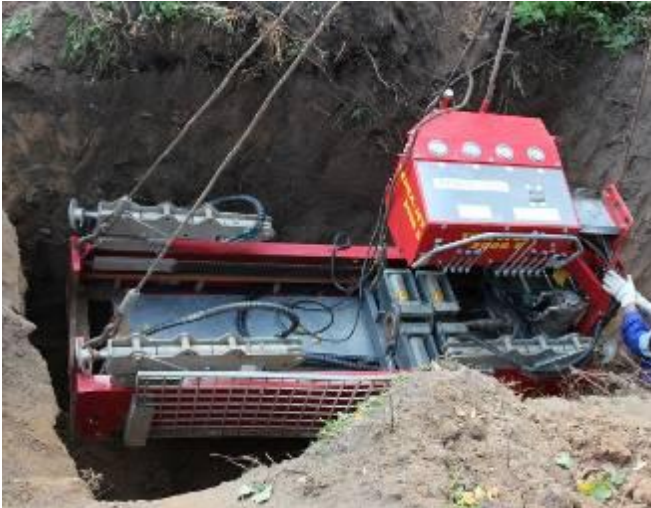
The TERRA-JET 3008 E has been installed in the starting pit.