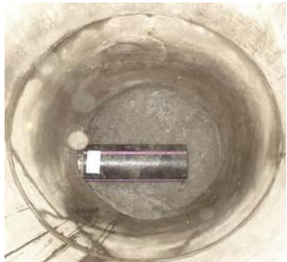
The mounted short pipe module during bursting.

TERRA AG, Hauptstrasse 92, 6260 Reiden, Switzerland, tel.: +41-62-749 10 10, fax: +41-62-749 10 11 e-mail: office@terra-eu.eu , internet: www.terra-eu.eu