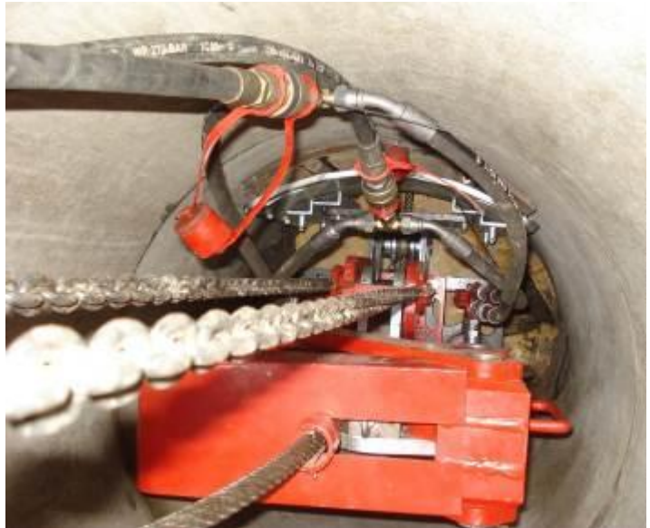
The TERRA-EXTRACTOR X 300 C installed in the manhole \varnothing 800 mm (32").