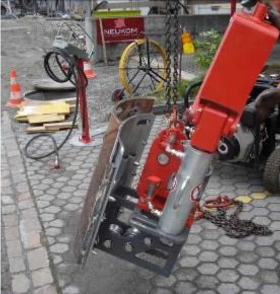
The cable burster with bent front plate is ready for installation in the manhole \varnothing 800 mm (32").