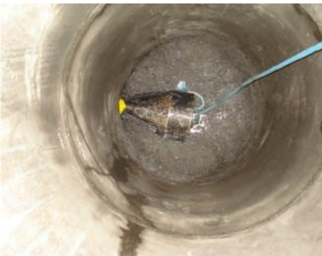
The bursting head in the manhole \varnothing 600 mm (24")